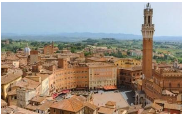
Piazza del Campo

Siena is a truly gorgeous city. We will unfortunately miss the famous wild horse race il Palio , which is held in the stunning Piazza del Campo every July and August but we are still likely to see young men parading in historical costume