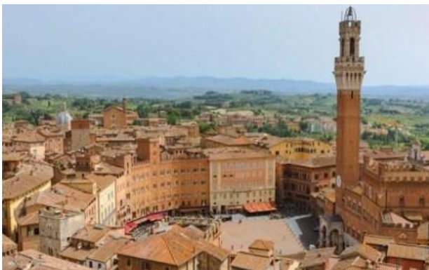
Piazza del Campo

Siena is a truly gorgeous city. We will unfortunately miss the famous wild horse race il Palio, which is held in the stunning Piazza del Campo every July and August but we are still likely to see young men parading in historical costume